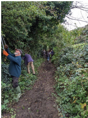
Hard at work chopping overhanging branches