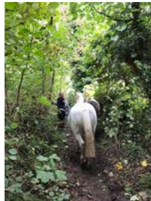
A local rider comes through